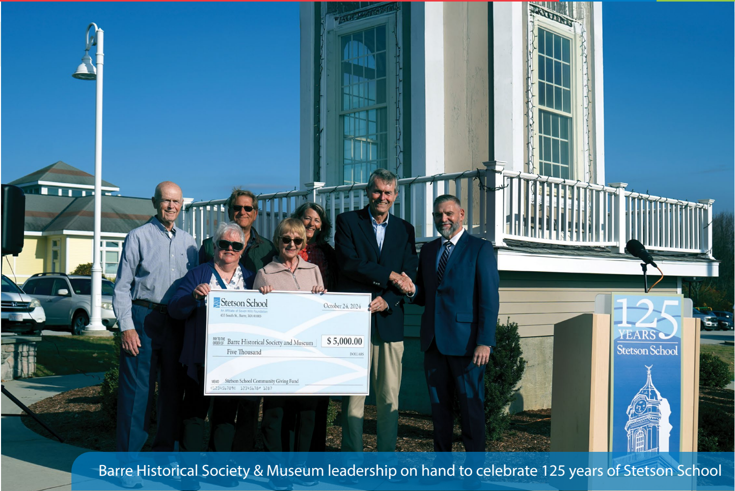
Barre Historical Society & Museum leadership on hand to celebrate 125 years of Stetson School