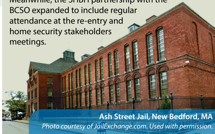
Ash Street Jail, New Bedford, MA

At the same time, SHBH began a weekly Women's group that became the "Home of Hope," the first SHBH drop-in center for women. Ten years ago, the program expanded to include male inmates. Meanwhile, the SHBH partnership with the BCSO expanded to include regular attendance at the re-entry and home security stakeholders meetings.