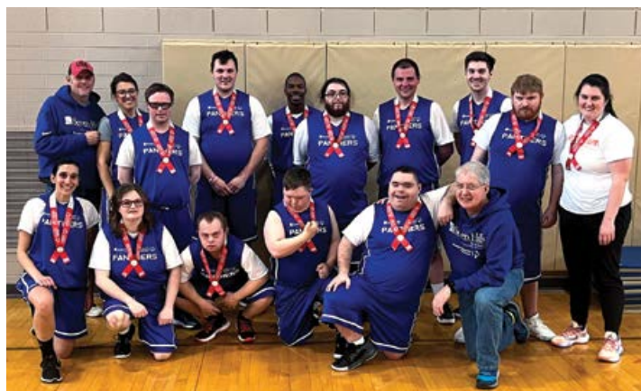
The Panthers finish the finals at Assumption