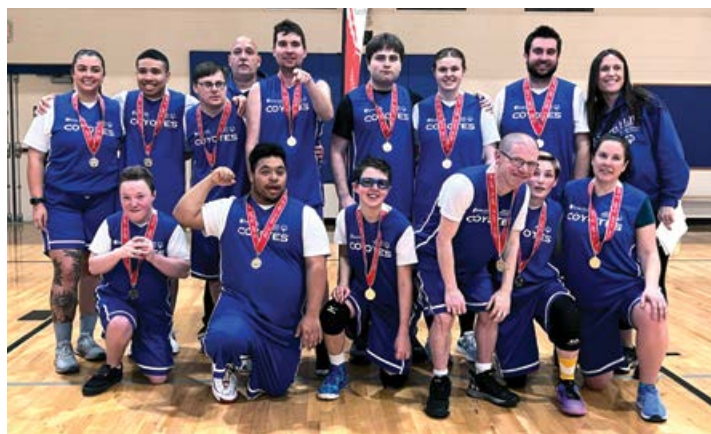
The Coyotes wear their Gold with PRIDE